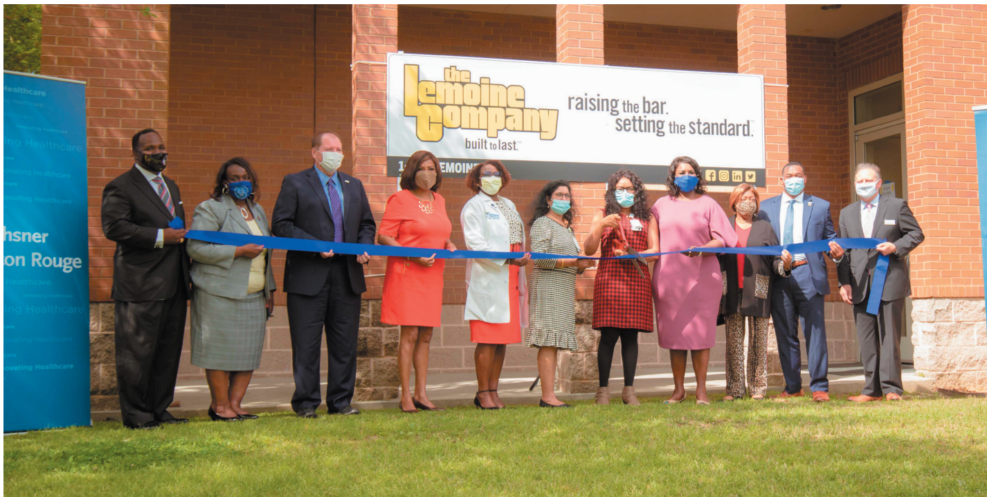
Participants applaud after a ribbon-cutting held during a program commemorating the opening of the Ochsner Community Health Brees Family Center. It's a new 5,000-square-foot primary care health clinic, named after its main donor's nonprofit the Brees Dream Foundation. The Baton Rouge location is expected to serve 10,000 patients in its first year to underserved communities in north Baton Rouge with the goal of promoting health equality.

"Our goal is to work in collaboration, not competition, with other community partners to provide greater access to care,"