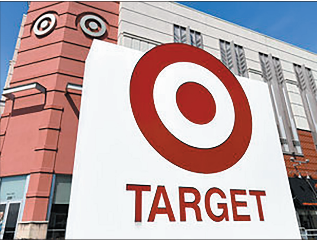
A view of the Target store in Annapolis, Md., Wednesday, March 18, 2020. Target is closing their stores at 9 p.m. daily to give employees time to replenish and deep clean the stores for shopper amid the coronavirus outbreak. Target also announced it will limit the first hour of shopping each Wednesday to the elderly and people with underlying health conditions

Target committed to spending over $2 billion with Black-owned businesses by 2025, the company announced on Wednesday, according to the New York Times. The company will work together with more Black-marketing companies to introduce Black-owned products from over 500 Black-owned businesses to its store and website.