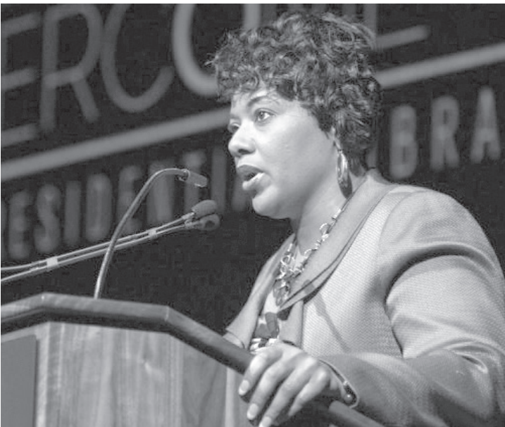
Bernice A. King joined the children of late civil rights champions the Rev. C.T. Vivian, and U.S. Rep. John Lewis, in blasting voter suppression laws that have cropped up since the 2020 election. (Photo: Bernice A. King, daughter of Martin Luther King Jr. and the CEO of the King Center introduces civil rights leaders Julian Bond, John Lewis, and Andrew Young at the Civil Rights Summit at the LBJ Presidential Library.)

Georgia Gov. Brian Kemp, a Republican, signed into law legisla-