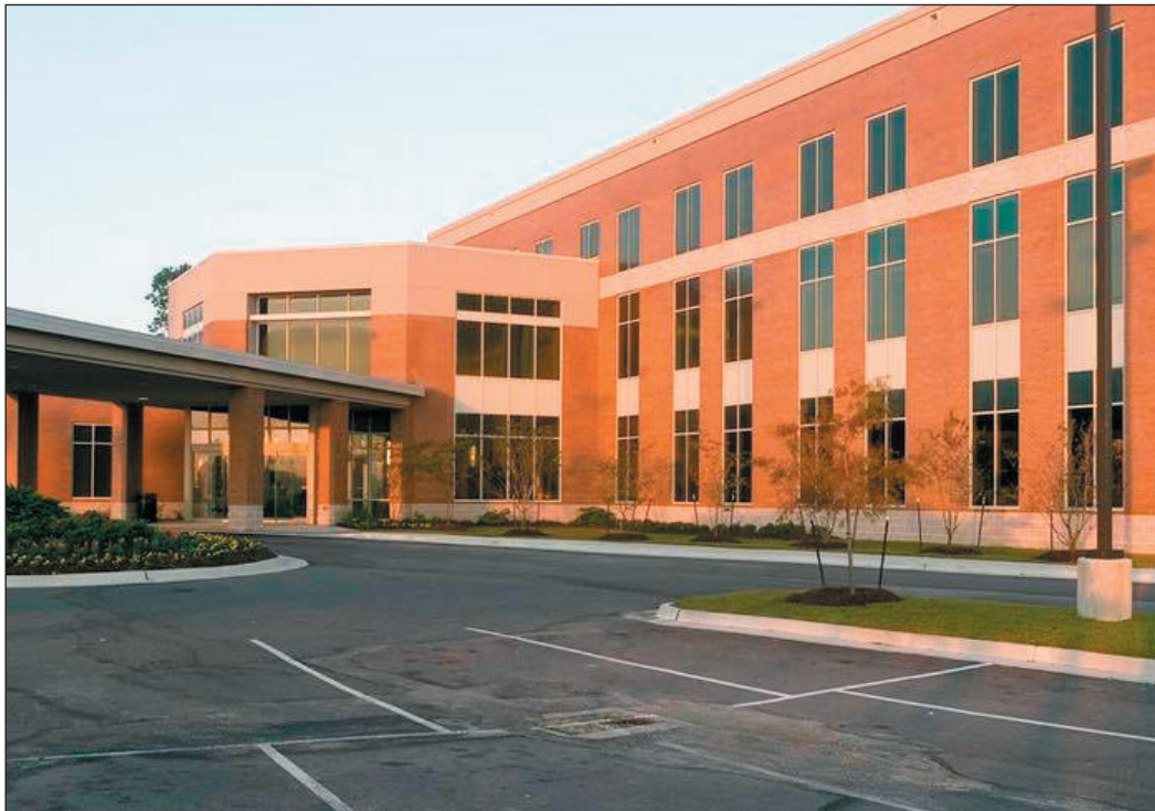
The Howell Place hospital opened in 2005 and was operated by Cambridge Healthcare Management Inc. of Dallas as a 10-bed surgical hospital until 2012.