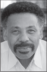
Dr Tony Evans

Many of us today find ourselves on a leash. The links in the chain are anger, bitterness, resentment, and revenge. All these, however, come down to one thing — unforgiveness. Unforgiveness holds us hostage, and when we try to pull away, it pulls us right back and we find ourselves prisoners of what someone else has done to us or perhaps what we have done to ourselves.