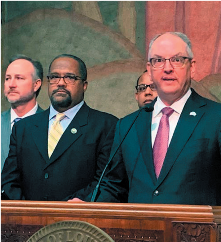
Gov. John Bel Edwards announces the creation of a hotline to help residents obtain a COVID-18 vaccine.

Edwards said that helping more residents get vaccinated remains the best solution. He said the hotline will address two barriers: lack of access to the Internet and "tech-savviness," or the time it takes to navigate the scheduling platforms, as well as a lack of ac-